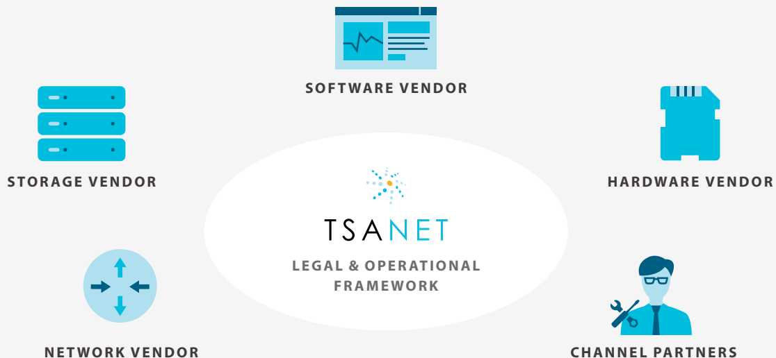
EXAMPLE: ENTERPRISE SOLUTION